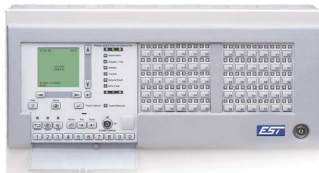
QuickStart's contoured CPU/Display Unit houses the panel's CPU card and mounting space for optional LED/Switch cards. These are used for point/zone annunciation and control.

put Signature Series into a new addition and keep existing devices in the rest of the building. There's no big installation charge either. With single-button programming and no internal wiring to do, QuickStart panels are configured and installed pronto.