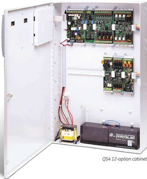
QS4 12-option cabinet

All QuickStart packages include a cabinet, power supply, CPU, display, and 115v transformer. QS1 single loop panels come standard with an SLIC loop controller. QuickStart option cards provide a wide range of features and extra system capacity. Thanks to the convenient Quick-Lock mounting system, option cards snap onto the DIN mounting rails easily and securely. The hybrid multiple loop QS4 and the Conventional QSC control panels are available with enclosures for either 5- or 12-option cards.